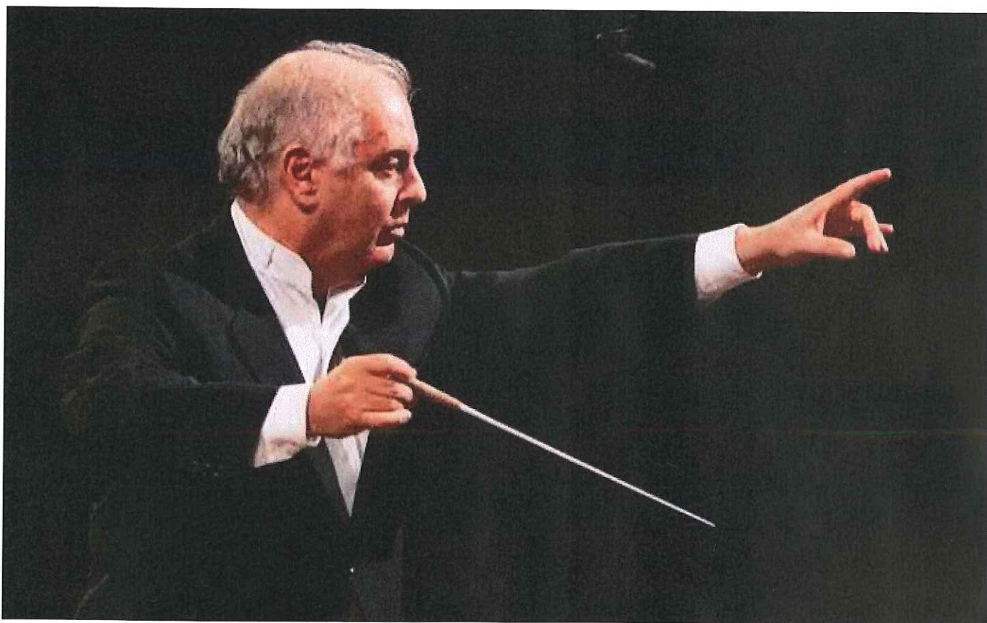
Daniel Barenboim

And this year the 83-year-old is back at the Proms, in the company of one of classical music's most popular and revered figures, Daniel Barenboim, who conducts Birtwistle's new orchestral piece Deep Time on Sunday, having already conducted the world premiere in Berlin.