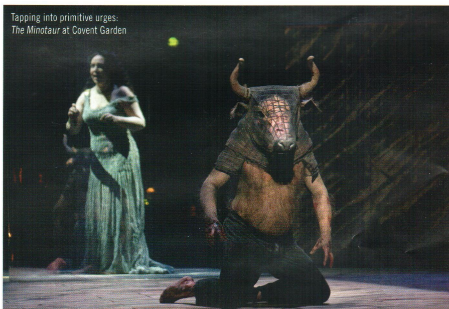
Tapping into primitive urges: The Minotaur at Covent Garden