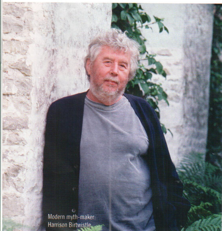
Modern myth-maker: Harrison Birtwistle

22 May-5 June: The Wiener Kammeroper production of Punch and Judy will be staged at Vienna's Theater am Fleischmarkt from ( www.theatre-wien.at ).